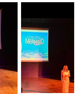
Students demonstrated their talents on Wednesday to family and friends