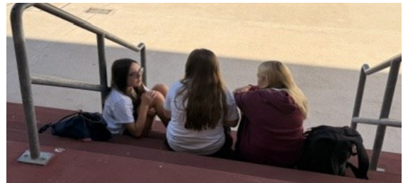
Students return to school following the half term holiday on Monday 1st June.