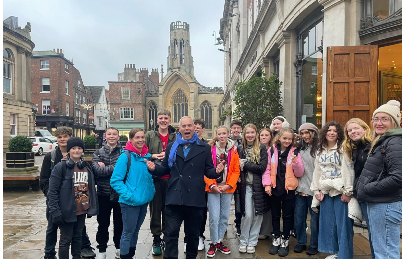
Our students with celebrity Judge Rinder in York

Overall, the York trip was a huge success and a brilliant example of the opportunities Aspire offers. Applications for next year's Aspire cohort for current Year 7 students will open around Easter, and we look forward to welcoming the next group of Aspire students.