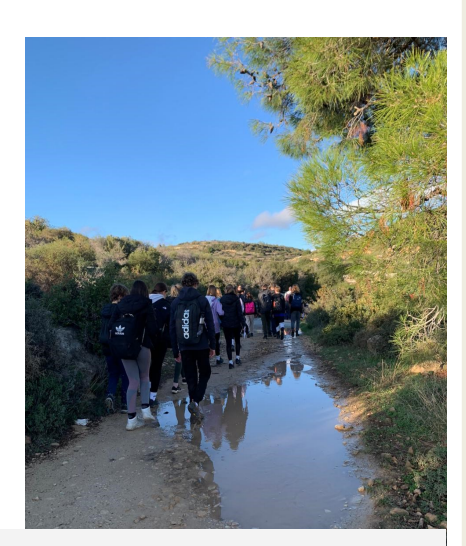
An authentic DofE experience