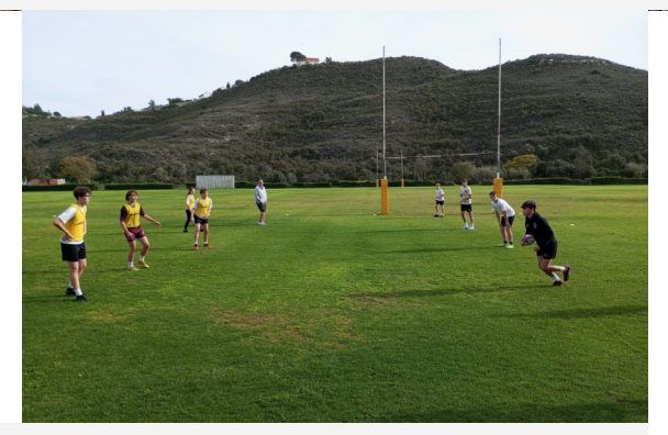
Rugby training at Happy Valley