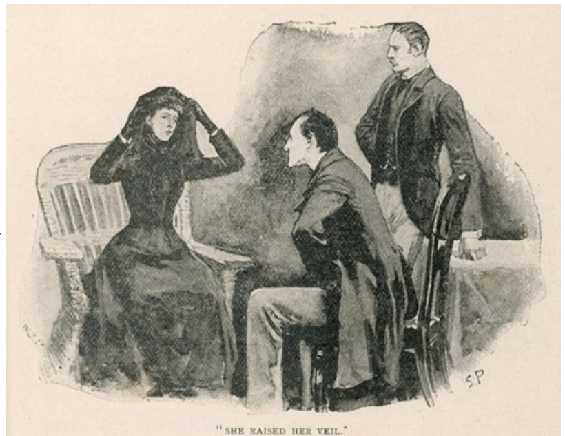
"SHE RAISED HER VEIL."