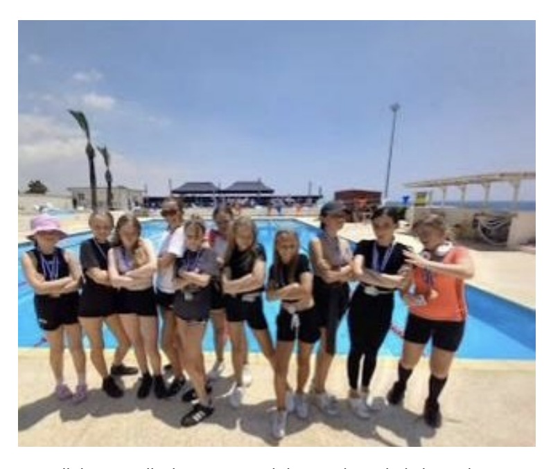
Well done to all who competed this week in Dhekelia in the Year 7 Swimming Gala. Thank you also to our Sixth Formers for supporting this fantastic event.