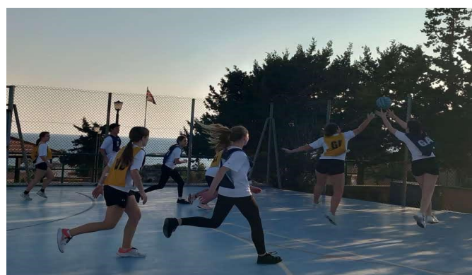
Our netballers were victorious at King Richard School during their midweek fixture