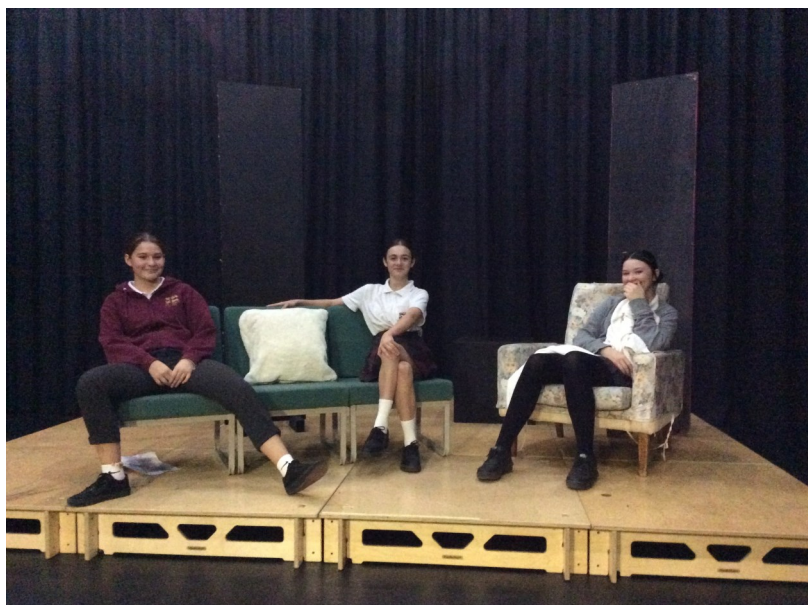
Year 11 students take a moment after setting up the staging for their GCSE Drama Coursework