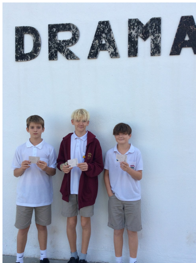
Well done to these Year 8 boys who have continued to demonstrate excellence in Drama