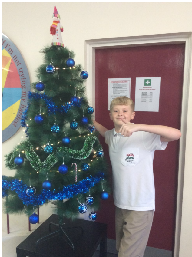
Thank you for helping decorate our school tree