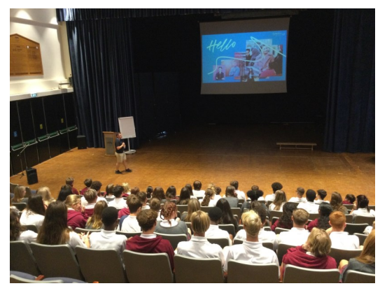
Students in Year 10 and 11 hear about what life is like at university with a visit from Coventry University