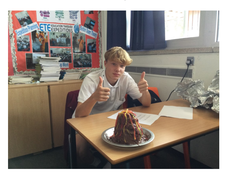
Tasty Homework! A Volcano Cake