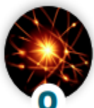
Q is for Quantum Physicist