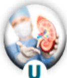
U is for Urologist