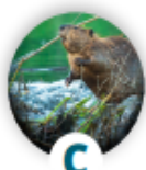
C is for Conservationist