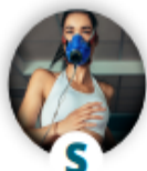
S is for Sports Scientist