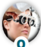
O is for Optician