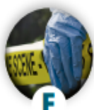
F is for Forensic Scientist