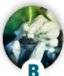
B is for Botanist