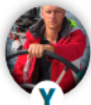
Y is for Yacht Master