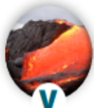
V is for Volcanologist