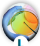
L is for Lab Technician