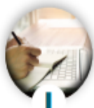
J is for Journalist