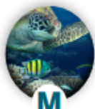
M is for Marine Biologist