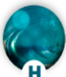
H is for Hydrotherapist