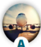
A is for Aeronaautical Engineer