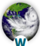
W is for Weather Forecaster