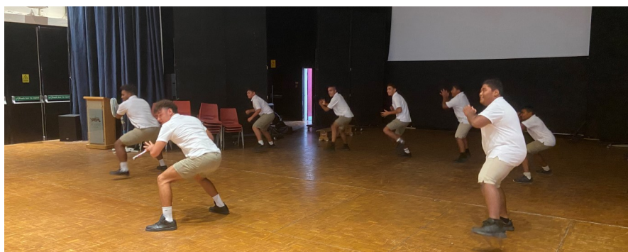
Fiji Day Celebration Rehearsals