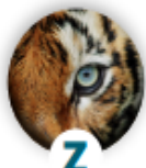
Z is for Zoologist

Join the conversation #whysciencematters