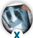
X is for X-ray Technician