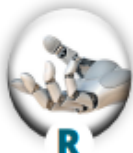
R is for Robotician