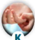
K is for Kinesiologist