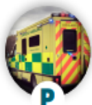
P is for Paramedic