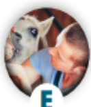
E is for Equine Dentist