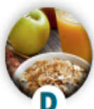
D is for Dietician