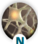
N is for Neuroscientist