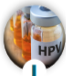
I is for Immunologist