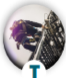
T is for Telecoms Technician