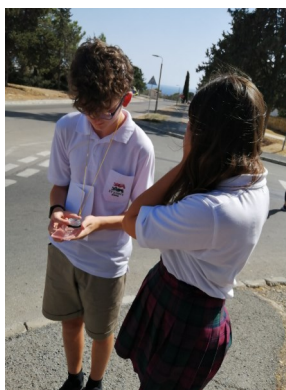
Duke of Edinburgh Award