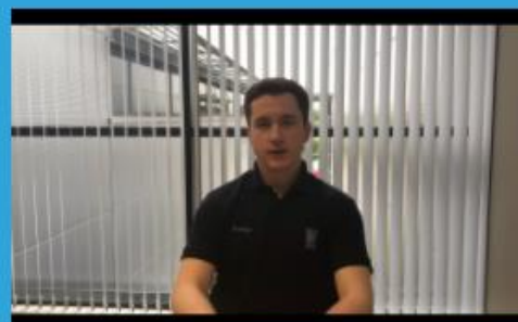
ANDY Rolls Royce