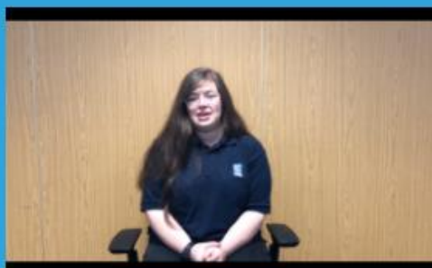
ALICE Rolls Royce