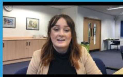
ABBY Opus People Solutions